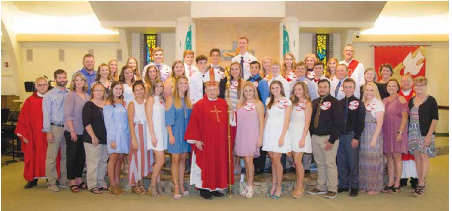
St. Leo's 2017 Confirmation group.

p.m. Sessions pull from a wide variety of Catholic sources and are intentionally designed to be interactive. This often includes a brief whole group presentation, small group discussions, and opportunities for prayer and reflection. All of this is done with a focus on discipleship, seeking to prepare and empower youth to embrace the mission of Catholicism.