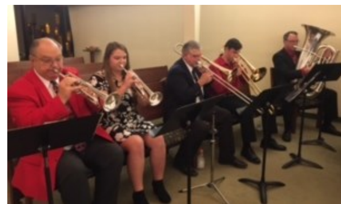
Brass quintet at Christmas

The Ladies of St. Leo's will be hosting a Bunco game night in February and March. ALL ladies of the parish are invited. Please come enjoy appetizers, fellowship and prizes. Watch the bulletin for more information!!