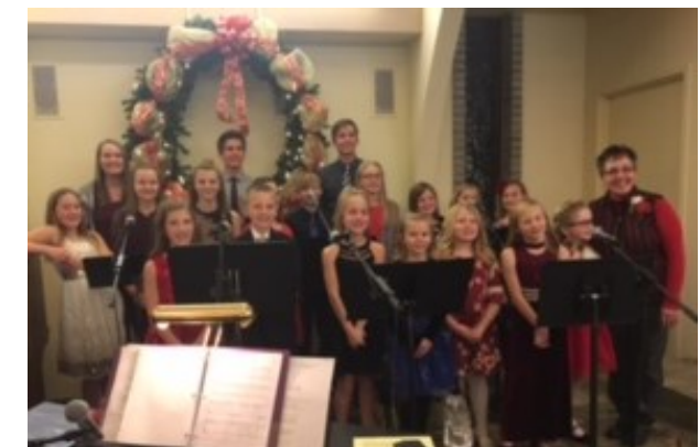
Children's Christmas Choir at Christmas

MUSIC PRACTICE WEDNESDAY NIGHTS AT 7:15 PM. ALL ARE WELCOME TO COME AND SHARE THEIR MUSICAL GIFTS!